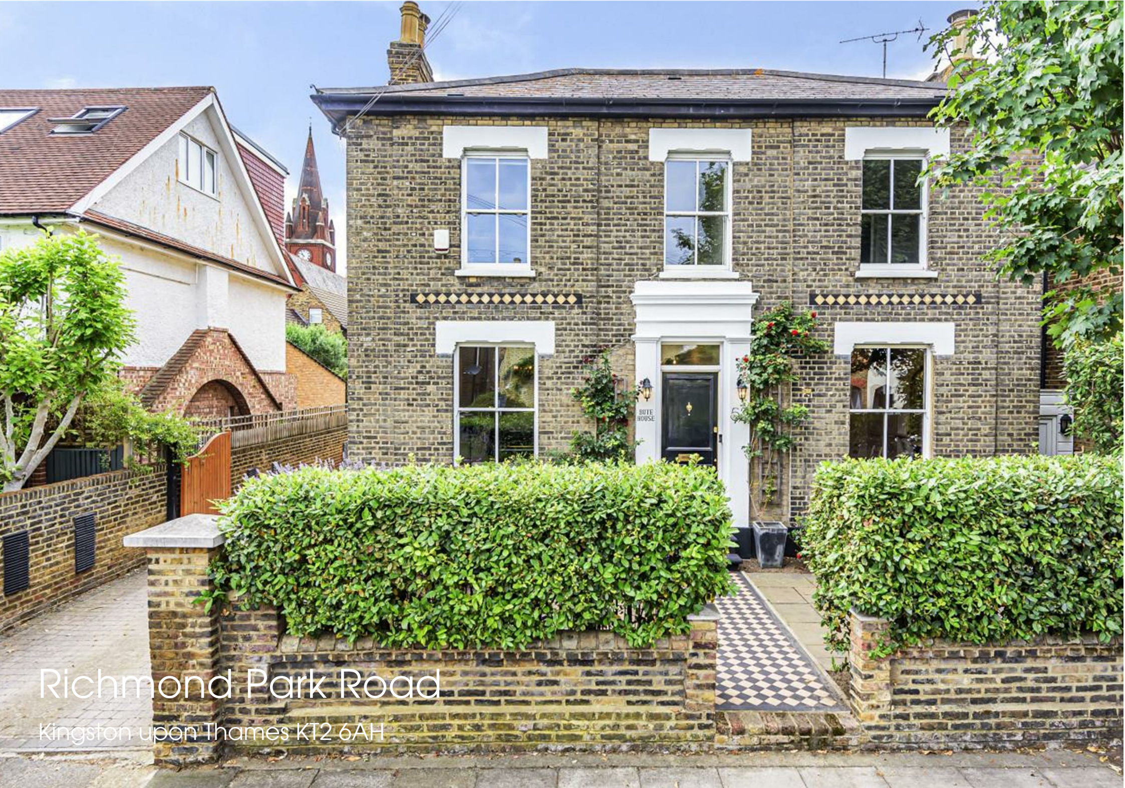
Richmond Park Road Kingston upon Thames KT2 6AH

34 Richmond Road Kingston upon Thames Surrey KT2 5ED www.gibsonlane.co.uk Tel: 020 8546 5444